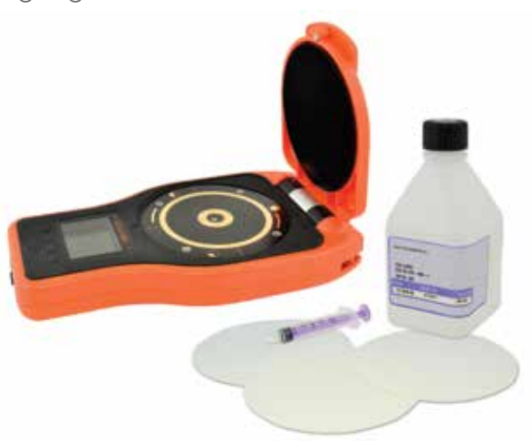
* The Elcometer 130 is supplied with a 1 year warranty against manufacturing defects. The warranty can be extended free of charge to 2 years within 60 days of purchase via www.elcometer.com.