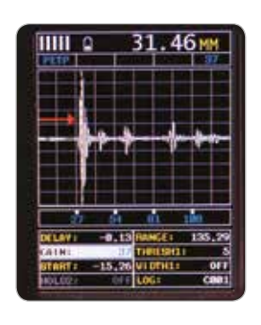
PETP Pulse - Echo Temp Comp Mode Similar to the PE mode, PETP takes into account and compensates for the variations in measurement caused by temperature variations.