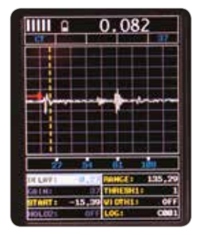
CT Coating Only Mode Displays the thickness of the coating applied to the material.