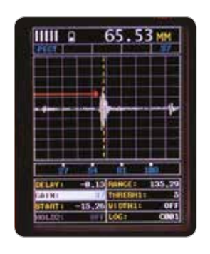
PECT Pulse - Echo Coating Mode Displays both the material thickness (PE) and the coating thickness (CT) at the same time.